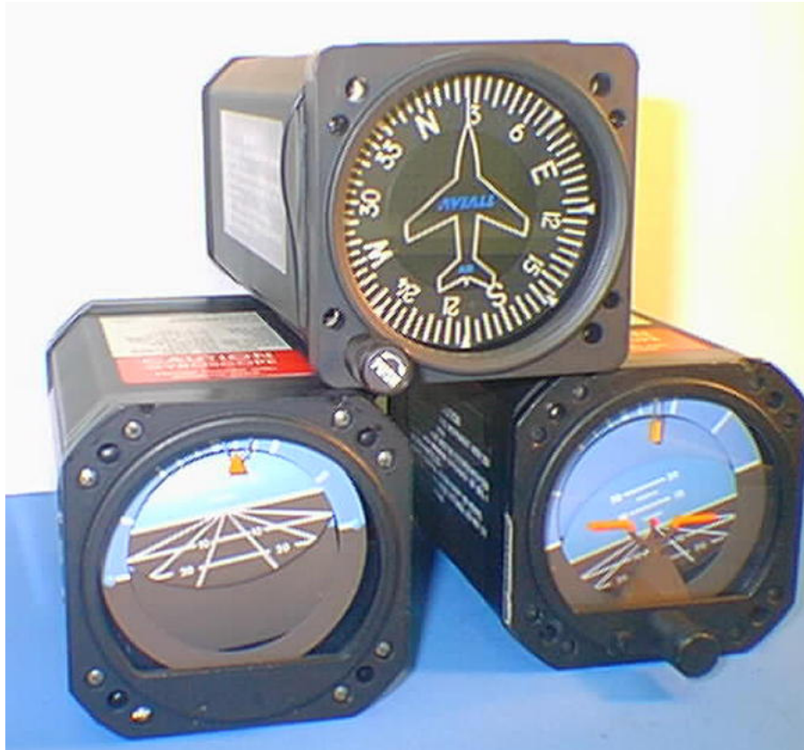
TYPICAL TYPES OF GYRO/INDICATORS